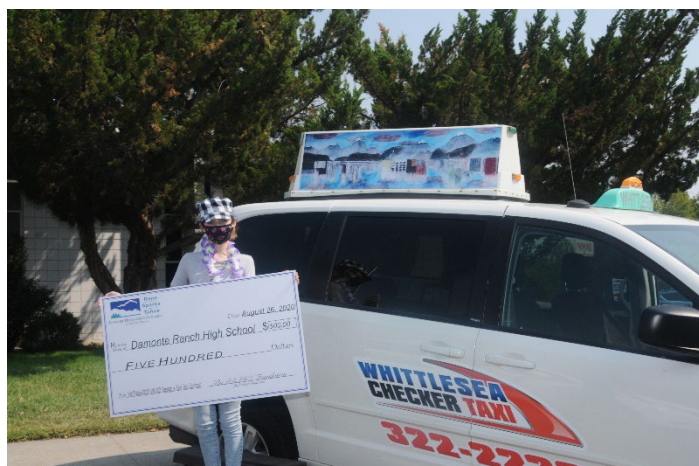
2020 finalists and one of the winning taxi top designs from August 26, 2020